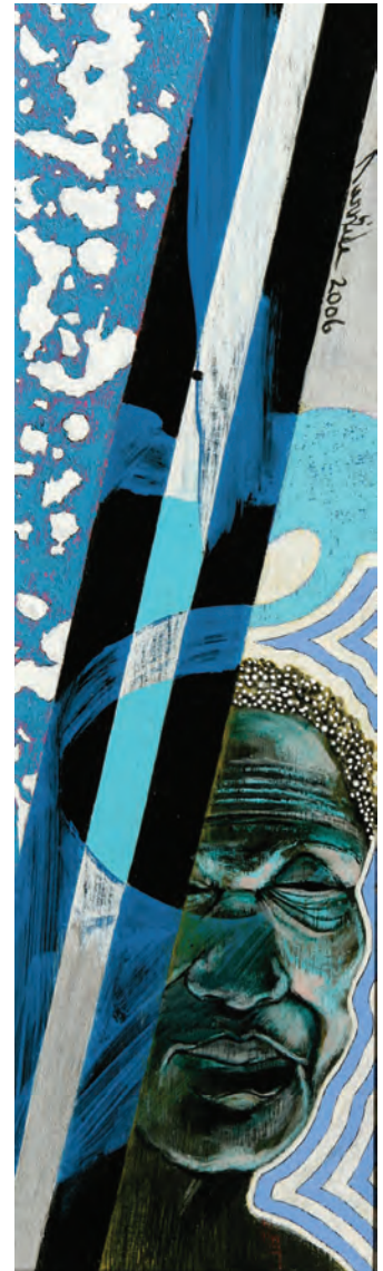
Stan Burnside. The Blacks & The Blues – Autumn 2006, from the collection of Dawn Davies.

The Bahamas is the perfect location to live, work and play.