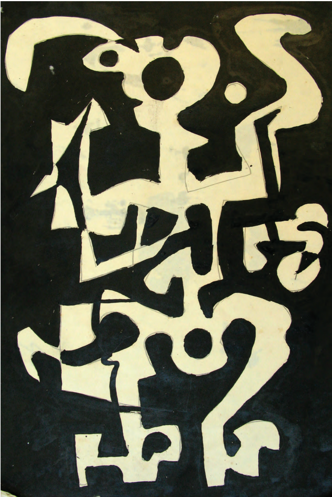
Kendal Hanna. Black White Sculptural Forms, 1994.